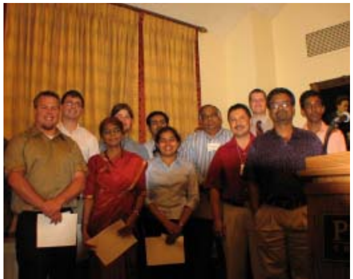
2007 ESA Student Paper Competition winners

Special Thanks to Mystic Tan, Inc. for the donation of $1000 towards student paper competition.